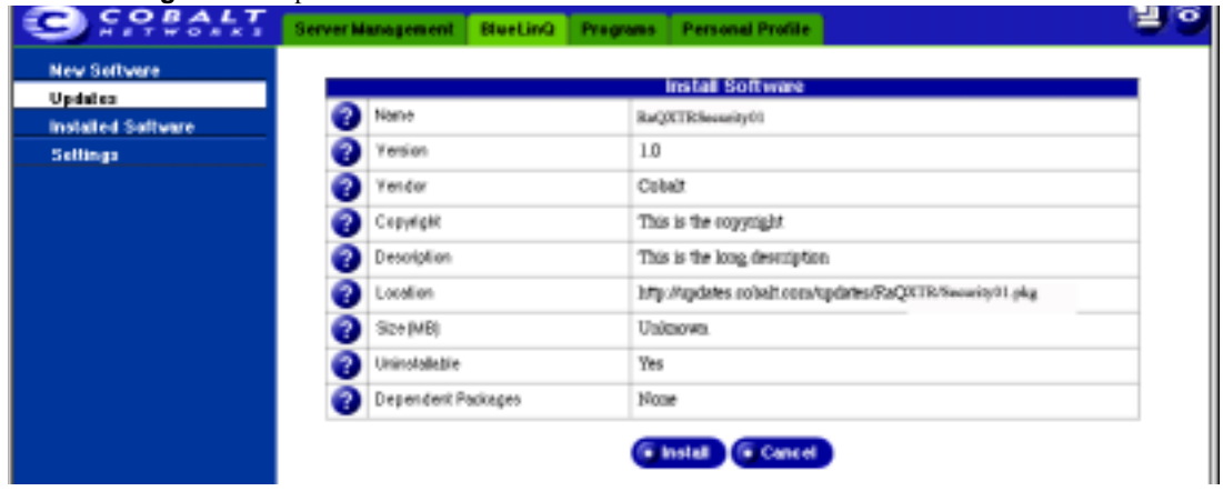
Figure 6. Update Software Installation Details

If you click on the magnifying glass, you see the information shown in Figure 4, "New Software Installation Details," on page 12, which corresponds to the information in Table 3, "Package List Format," on page 7.