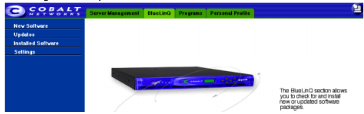
Figure 1. BlueLinQ

Update servers alert you if they have new software for your RaQ XTR. When the RaQ XTR is alerted that there is a new version of software, the update server and RaQ have the following dialog: