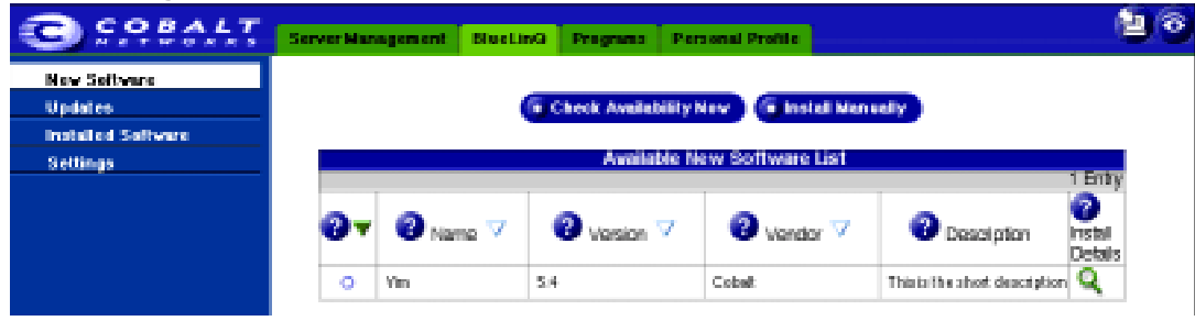
Figure 3. New Software Installed

If you click on the magnifying glass, you see the information shown in Figure 4 on page 12, which corresponds to the information in Table 3 on page 7.